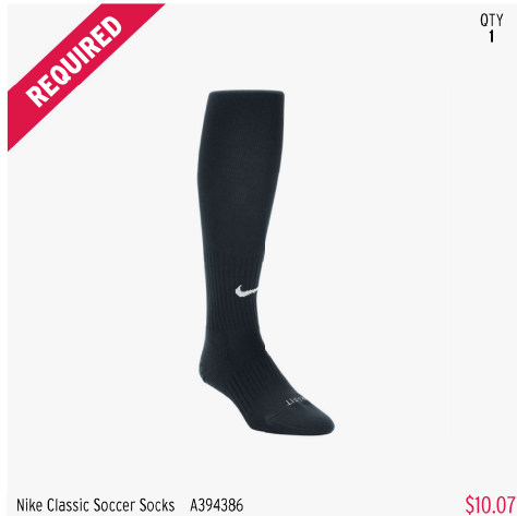
Nike Classic Soccer Socks A394386