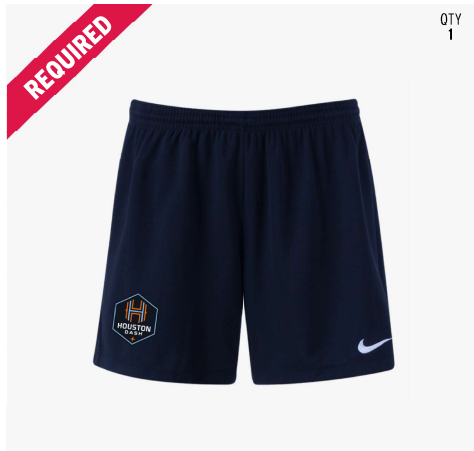
Nike Women's Park III Short A1035915