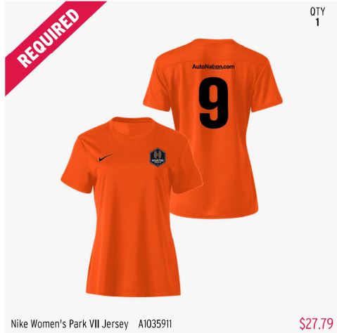
Nike Women's Park VII Jersey A1035911