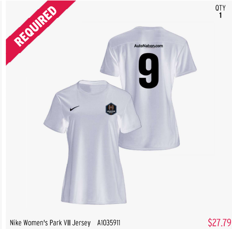
Nike Women's Park VII Jersey A1035911